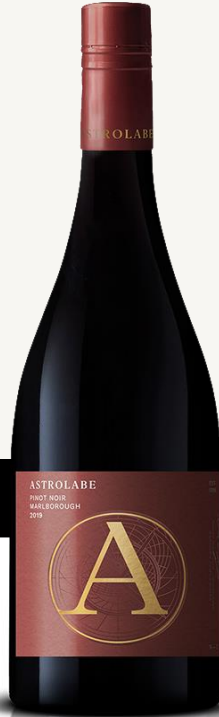
Marlborough Pinot Noir