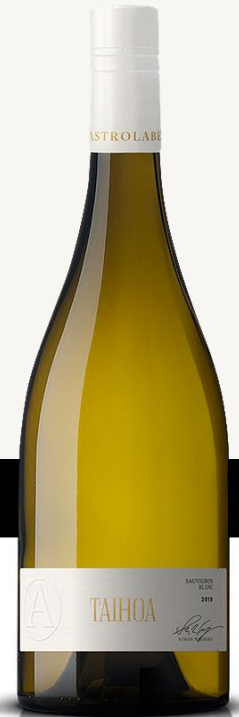
Taihoa Vineyard Sauvignon Blanc

Astrolabe grapes are sourced from ten families who live on their land and farm sustainably, many of the relationships are more than twenty years old.