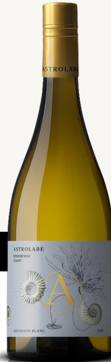
Kekerengu Sauvignon Blanc