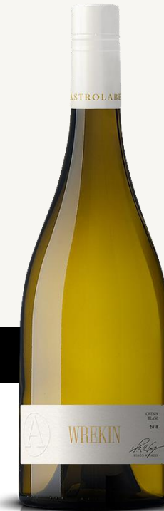
Wrekin Vineyard Chenin Blanc