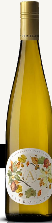
Marlborough Pinot Gris